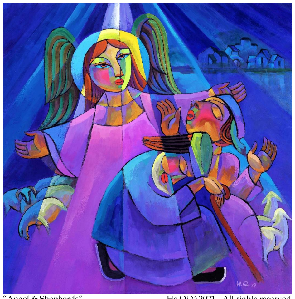
"Angel & Shepherds"